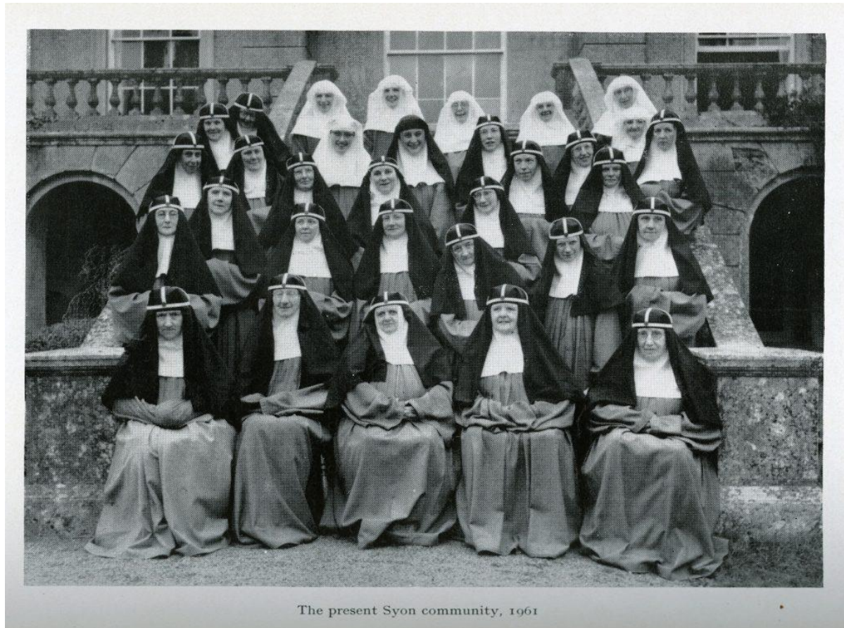
Photograph of the community in 1961. From 'The Poor Souls' Friend' 1960-1, p. 178.

Of course, the archive – deposited for safekeeping with the University's Special Collections in 2011 – has many more fascinating stories to tell from Syon Abbey's extraordinary history than have been briefly summarised above. It currently spans around 114 boxes and comprises material from the 16th to the early 21st century, although the majority of records date from the 19th and 20th century. The archive is large and complex, containing a range of different records relating to daily life; worship; religious rule; the management of land, property and finances; relations with other religious communities; and much, much more. Once catalogued, the archive has the potential to be a rich and powerful resource, particularly for anyone interested in the history of women religious, ecclesiastical history, and women's studies.