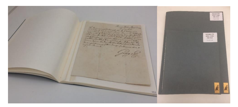
3. A letter signed by George III in a fascicule.