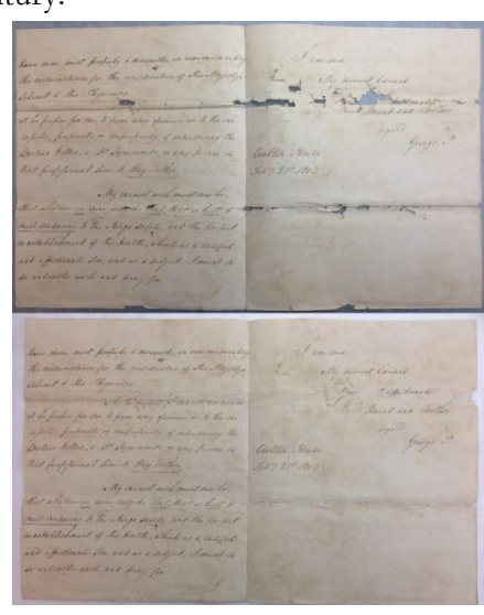
2. An example of a letter before and after conservation treatment.