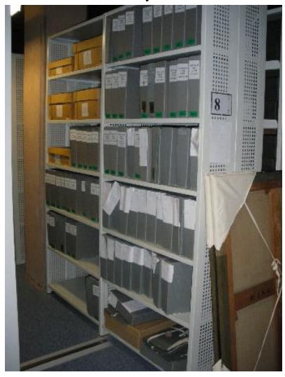
1. Storage of the Sidmouth collection before the project began.

Letters from 1705 to 1786 (around 370 items) frequently with lesser damage of tears or losses that could worsen with handling, have also been fully assessed, treated, rehoused in acid-free folders within archival boxes and relabelled. So far, almost two hundred of the letters of greater historical value have been mounted in fascicules for increased security. Work is ongoing to conserve all the other UFP letters in the collection. We have also begun on improving the labelling and storage of the collection, thereby making it easier for the search room staff to find the items requested. As this collection has experienced increased use over the past few years, this project will enable full access to an invaluable resource that provides great insight into the individuals and perspectives of politicians, members of the royal family, as well as abolitionists, naval and military heroes of the early nineteenth century.