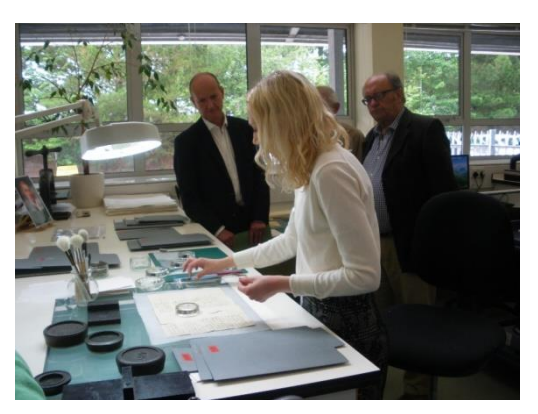
5. Demonstrating a conservation treatment on one of the letters with fine Japanese tissue and rice starch paste