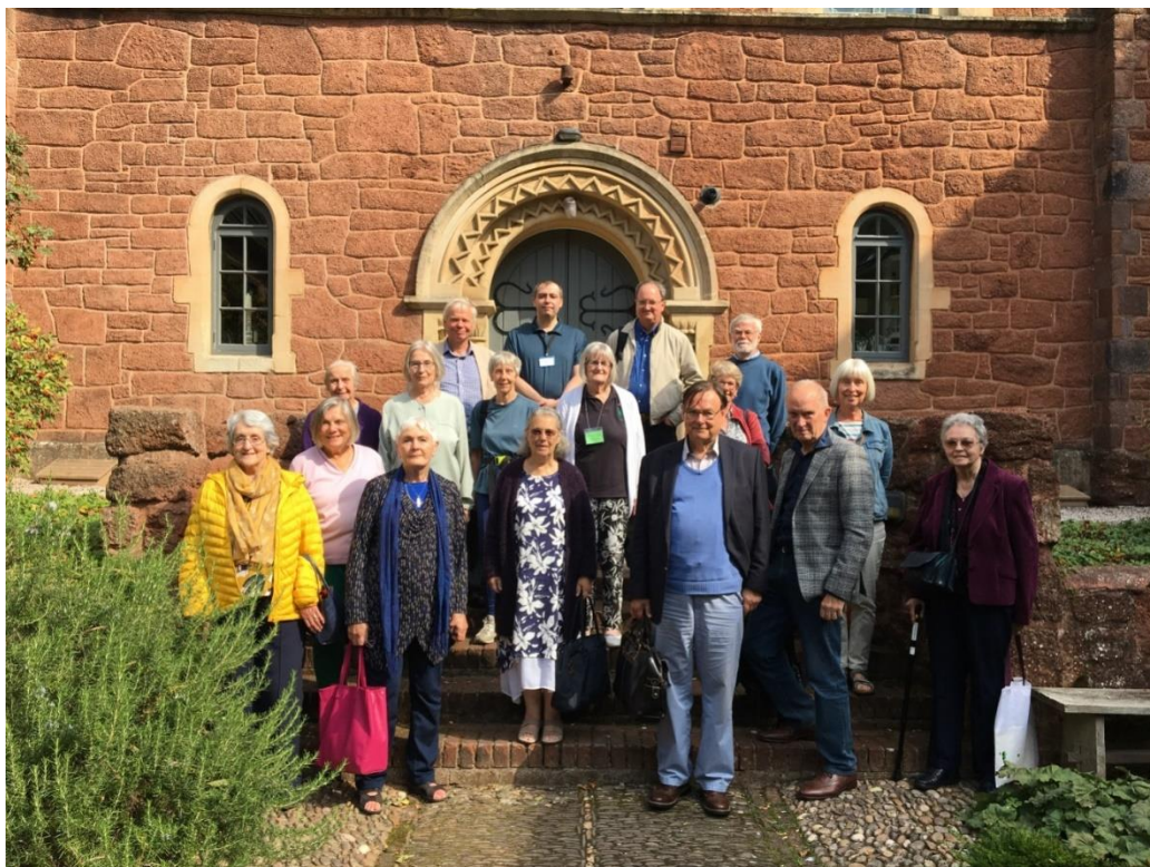
Attendees at the AGM and conference of the Friends of Devon's Archives, St.Nicholas Priory, Exeter, 21 September 2019