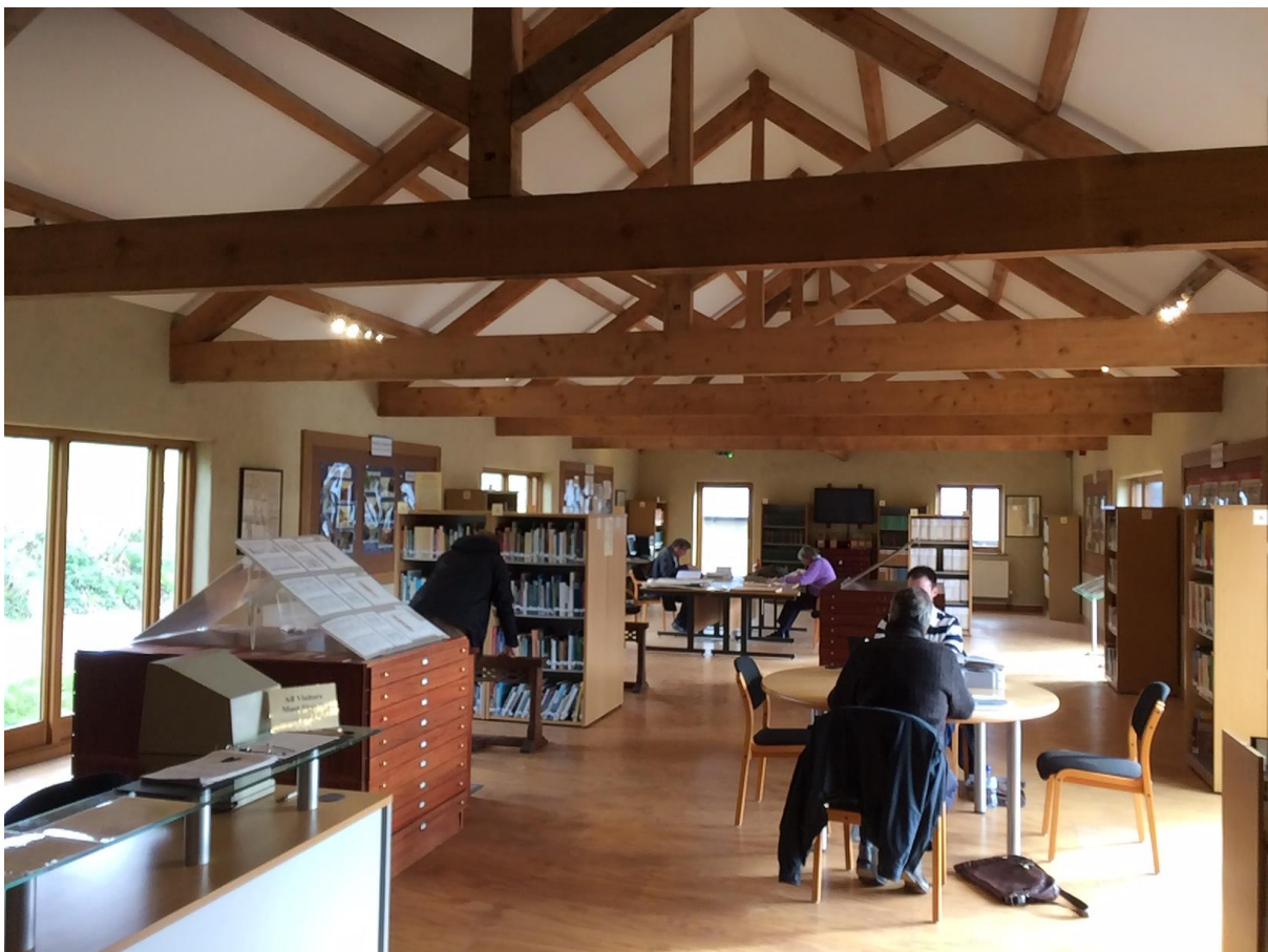
Researching in the DRA Library