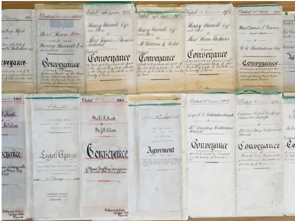
Manuscripts from the Collection